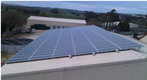
One part of the solar panel grid on the Elderton winery, Nuriootpa

A major solar panel grid was erected on the winery in September 2010 and is one of the largest solar projects undertaken by a winery in Australia. In 2013, we doubled the size of the system, to over 300 panels. This is helping to reduce the winery's carbon dioxide emissions by at least 110 tonnes annually.