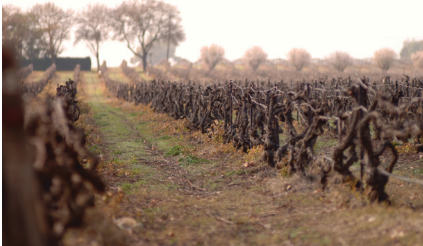
1894 Command vineyard

The goal of the Ashmead family is to produce world class wines from entrenched varieties grown in the Barossa from our own vineyard holdings. We celebrate the individual terroirs of each of our sites and aim to produce wines that show true regional history and character, varietal definition and a healthy slice of our own personalities.