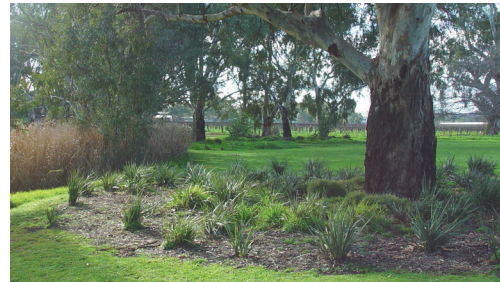
Riverbank revegetation, Elderton Estate, Nuriootpa