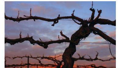
Estate vineyard after pruning

Varieties: Shiraz, Cabernet Sauvignon & Merlot