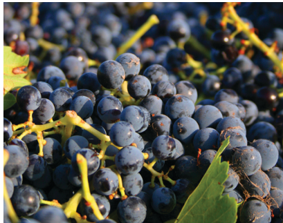
Grenache just picked