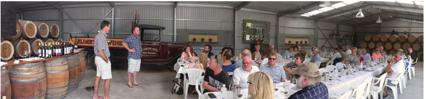
Wine and corporate events