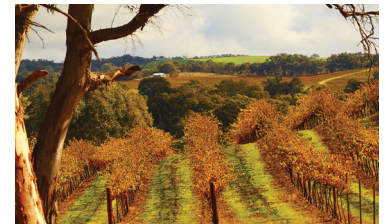
Craneford vineyard in autumn

Varieties: Shiraz, Cabernet Sauvignon & Chardonnay