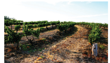
Greenock vineyard mid-season

Varieties: Shiraz, Grenache, Carignan, Mourvedre, Cabernet, Chardonnay & Semillon