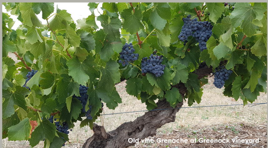
Old vine Grenache at Greenock vineyard

Our Craneford vineyard is lagging behind the Barossa Valley sites, which may test our nerve on waiting to pick that Cabernet before autumn rains (hopefully) arrive!