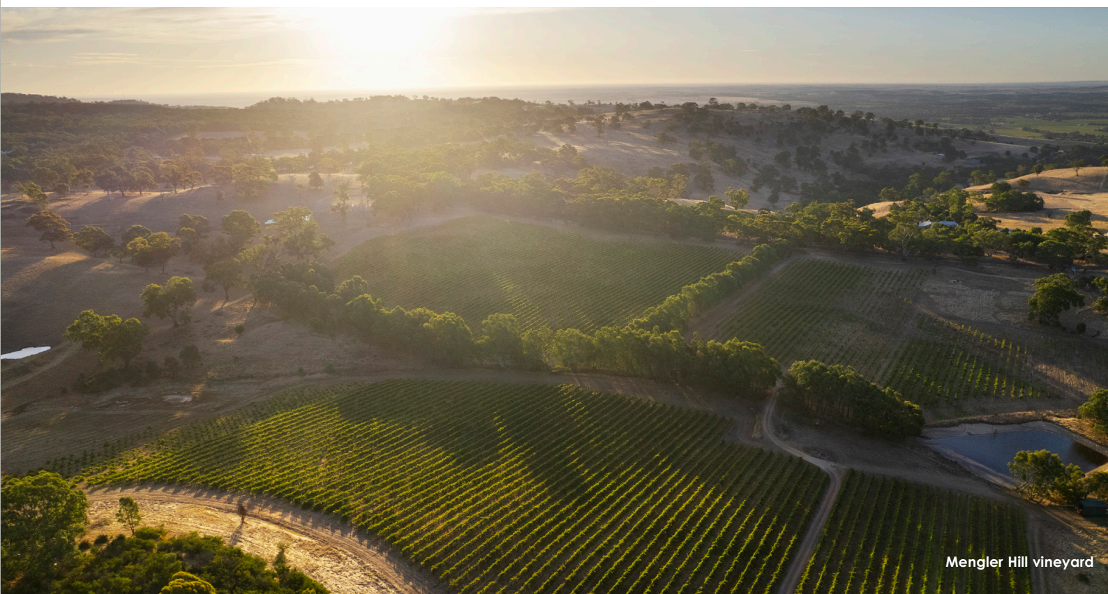
Mengler Hill vineyard